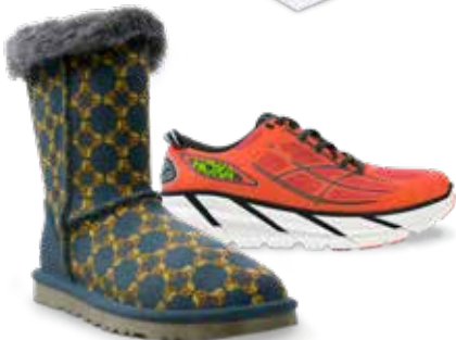
CJP parts realistically represent the final product's design intent Courtesy of Decker Brands