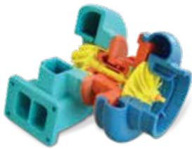
Turbocharger concept model, with each component color coded for easy identification

Closed-loop powder loading, removal, and recycling of natural products based build materials make it eco-friendly and safe to use. There are no physical support structures to remove with cutting tools or toxic chemicals.