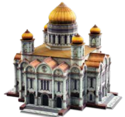
Large-scale architectural models can be printed in one piece

COMPACT TO GENEROUS BUILD VOLUMES - Access full color 3D printing with the affordable and compact ProJet CJP 260Plus printer, up to the large capacity ProJet CJP 860Pro with a build volume of 20 x 15 x 9 inches (508 x 381 x 229 mm) to create very large models or high volumes of prototypes.